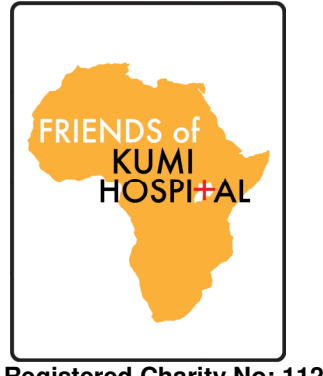
Registered Charity No: 1126962